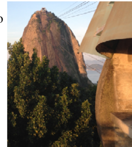
Sugarloaf Mountain, Rio