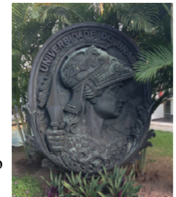
Federal University of Brazil, Rio